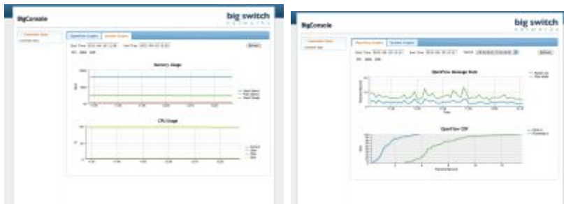
System Graphs OpenFlow Graphs